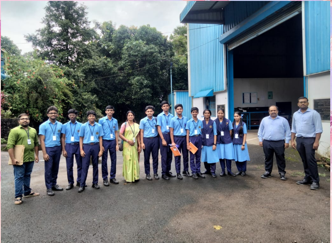
Commerce stream students of classes XI and XII made an industrial visit to Kerala Metal Industries, Shornur